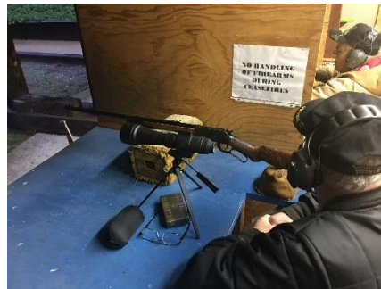
That looks like a nice “lever gun” on that rest. . .